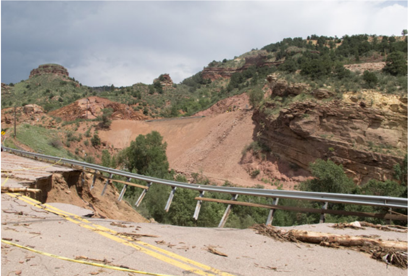
“Manitou Flood Damage”